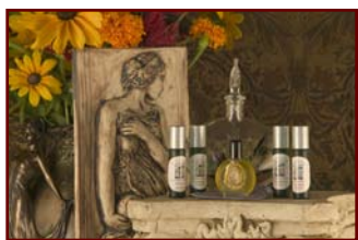
Divine Alchemy from the Goddess