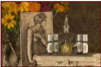
Divine Alchemy from the Goddess