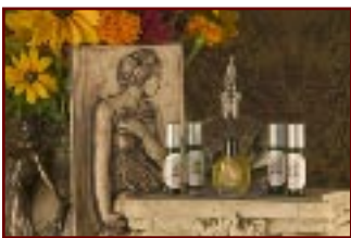
Divine Alchemy from the Goddess